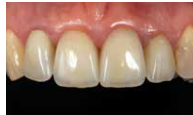
11 years in situ