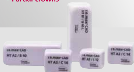
IPS e.max® CAD HT