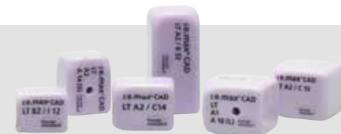
IPS e.max® CAD LT